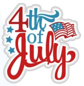
Parade starts at 1:00 PM Picnic & Concert at 1:30 PM

Pack a few blankets and chairs for Rancho Santa Fe's Annual 4th of July Parade & Picnic with live music, food, fun and more.